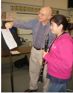
Students enjoy working with caring and dedicated instructors.

Who: Open to current 5th, 6th and 7th grade students who play or have an interest in playing a band instrument. Incoming 6th graders welcome.